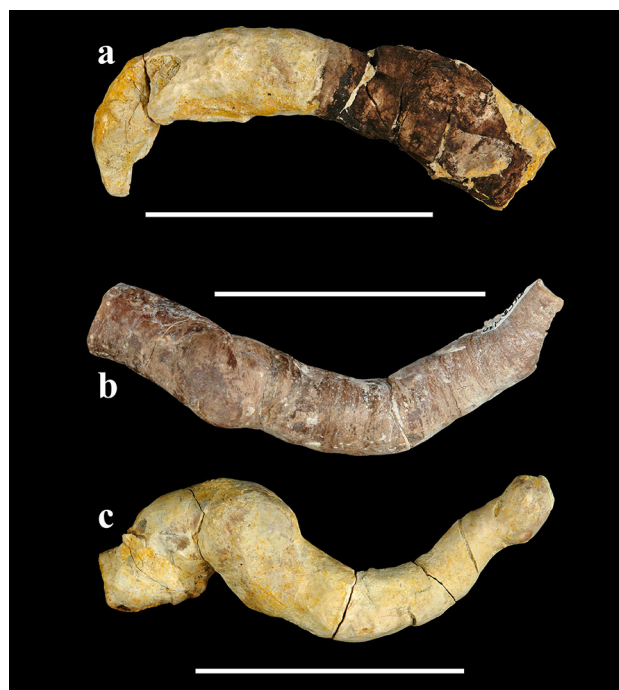
Fig. 2 Infills of bivalve borings, Apectoichnus longissimus (Kelly and Bromley), released from rotted xylic substrates from the Eocene of Seven Rivers, Jamaica. a UF 166582. b UF 166596. c UF 166597 (after Donovan et al. 2015, fig. 5f). Scale bars represent 50 mm

Description Small (largest specimen about 1 mm in diameter), paraboloid, rounded to elliptical, mainly incomplete holes with axis perpendicular to substrate. Outer edges countersunk.